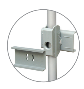
To convert the single-sided unit into a double-sided, use Snap-Clip #37321 to place over the single-side clip.