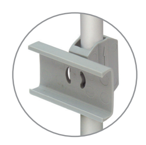
The single-sided Snap-Clip #37311 is used to connect the top and bottom horizontal bars to the vertical pole.