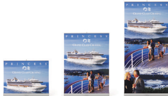
Roll-it-up 1 can even be used at various heights. By simply extending the pole to only 1/3 or 2/3 of its full length, you can quickly create a presentation in stages or a table-top display.