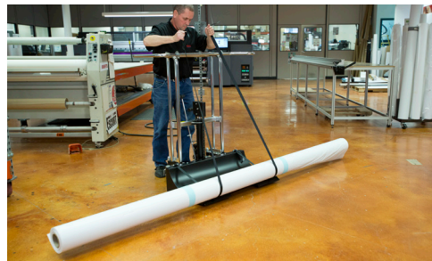
Got heavy rolls? Use the frame as a fulcrum to pull them onto the tray with minimal effort.