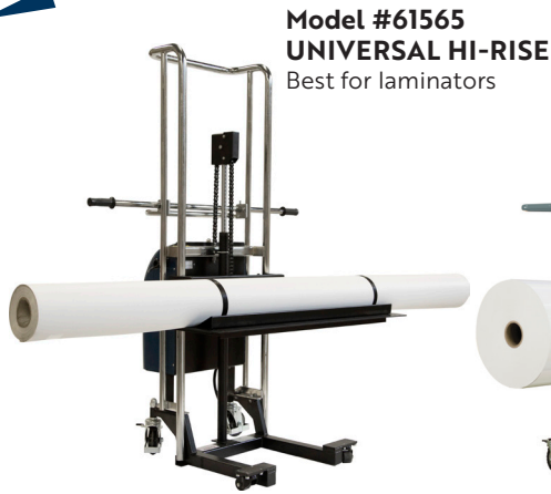
Model #61565 UNIVERSAL HI-RISE Best for laminators

With a push of the lever it easily lifts and lowers rolls