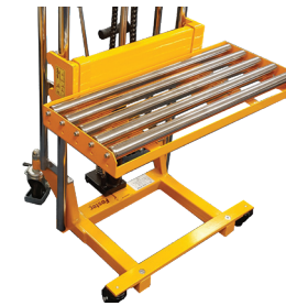
#63161 Roller Platform Overall size 800 x 325mm