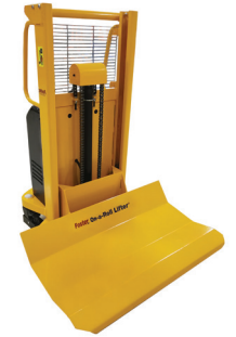
Model #61548 LOW PROFILE POWER GRANDE MAX Best for handling 2200 lb. rolls on printers with low clearances