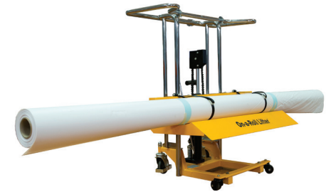
Model #61584 STANDARD Best for companies with limited floor space, 98" or smaller printers. Fits Mimaki, Roland, and most brands of printers.