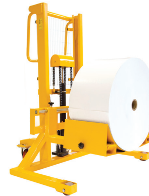
Model #61569 THE SCOOP The ultimate ergonomic and safe handling solution for 1000 lb. narrow web rolls up to 45" in diameter.