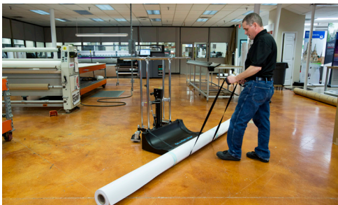
Safety straps pull rolls onto the tray with minimal effort.