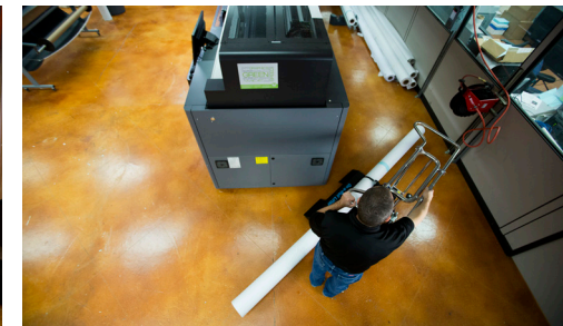
Ergonomically shaped bar and swivel casters allows operators to push or pull On-A-Roll® Lifters from any angle – go around tight corners, narrow aisles and through doorways.