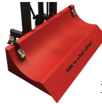
#63292 Tray with Roll Ramp enables operators to push rolls on the floor up onto the tray