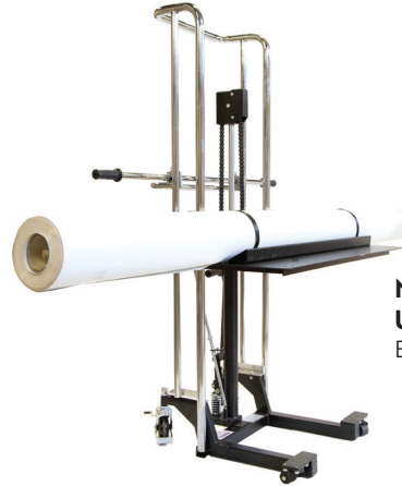
Model #61564 UNIVERSAL HI-RISE Best for laminators