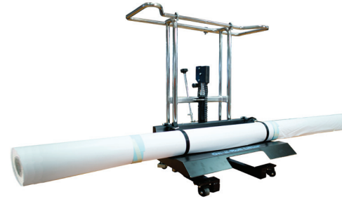
Model #61574 LOW PROFILE Fits all models of HP Grand Format Latex and STITCH dye-sub printers