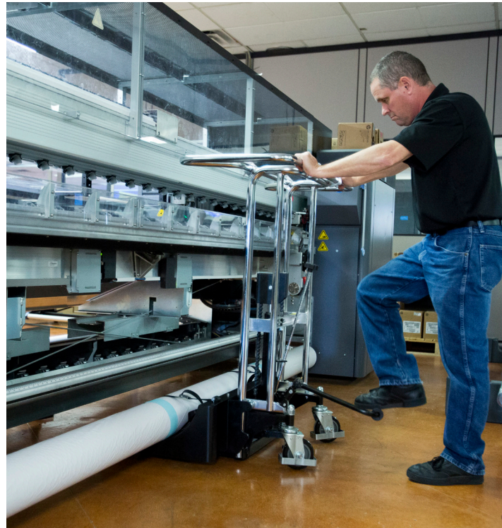
Specially designed low Profile tray and casters fit inside the printers roll loading area.

Ergonomics are an investment that benefits your people and your bottom line.