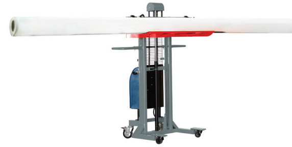
Model #61599 POWER JUMBO 70'' Best for fabric printing and finishing applications