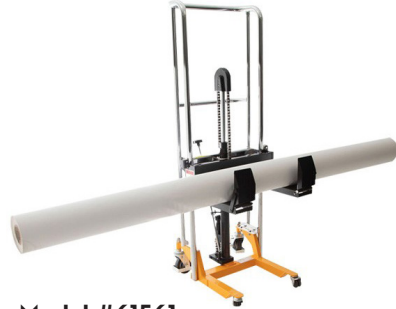
Model #61561 COMPACT-2 Best for shops with limited floor space, 72" W or smaller printers. Fits Monti Antonio and other calendaring machines with tight clearances between rollers

Questions? Call the experts at Foster 800-523-4855 customerservice@go-foster.com