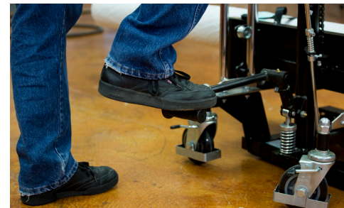
Easy to operate foot pump raises roll to correct height for transport and loading roll into the printer.