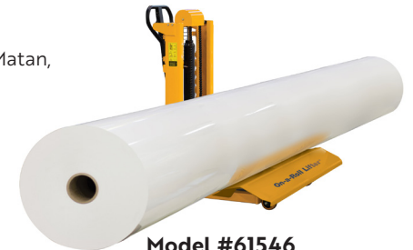
Model #61546 LOW PROFILE GRANDE MAX Best for handling 2200 lb. rolls on printers with low clearances