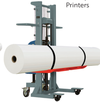
Model #61595 POWER JUMBO 42'H Best for EFI, Regianni, Matan, and Vanguard Printers