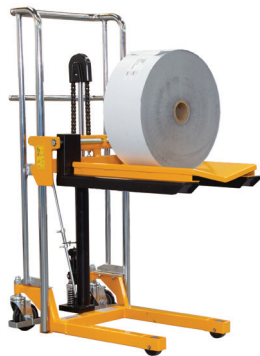
Model #61566 V-TRAY Best for narrow web flexo and digital printers, converters, and rewinders for rolls up to 30" in diameter