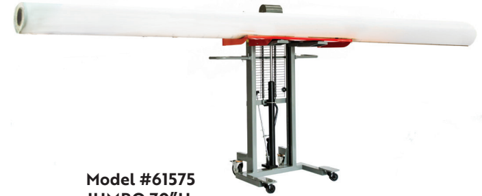
Model #61575 JUMBO 70"H Best for companies with limited floor space, 98" or smaller printers. Fits Mimaki, Roland, and most brands of printers.