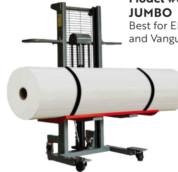
Model #61577 JUMBO Best for EFI Regianni, Matan, and Vanguard Printers