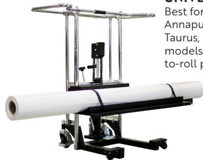
Model #61580 UNIVERSAL Best for AGFA Annapurna and Taurus, and other models of roll-to-roll printers