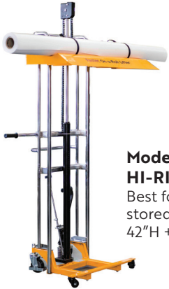
Model #61570 HI-RISE Best for reaching rolls of fabric stored high and loading onto 42"H + spreader and finishing tables