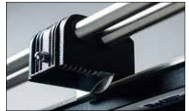
Dual stainless steel guide rails eliminate cutting head swivel