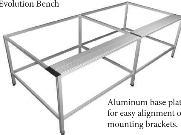
Aluminum base plate for easy alignment of the mounting brackets.