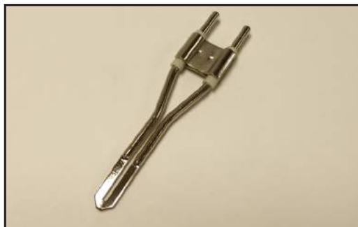
Model # 67101 Type N Blade

This precision-based pointed blade with 9mm of heated cutting area is designed for fine fabrics and is useful in projects requiring curved cuts.