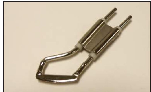
Model # 67102 Type R Blade

This general-use blade (1.14 inches of heated surface) cuts straight lines easily on glass surfaces and is designed for synthetic fabrics, webbing and ropes of up to 17mm diameter.