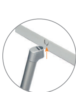
Pole with extrusion adapter is connected to top profile.