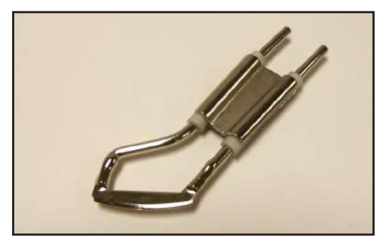
This general-use blade (1.14 inches of heated surface) cuts straight lines easily on glass surfaces and is designed for synthetic fabrics, webbing and ropes of up to 17mm diameter.