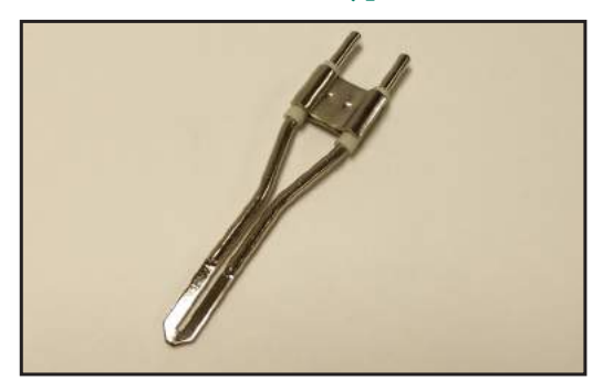
This precision-based pointed blade with 9mm of heated cutting area is designed for fine fabrics and is useful in projects requiring curved cuts.